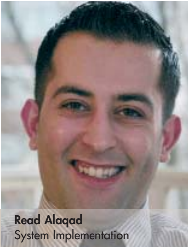
Read Alaqad System Implementation